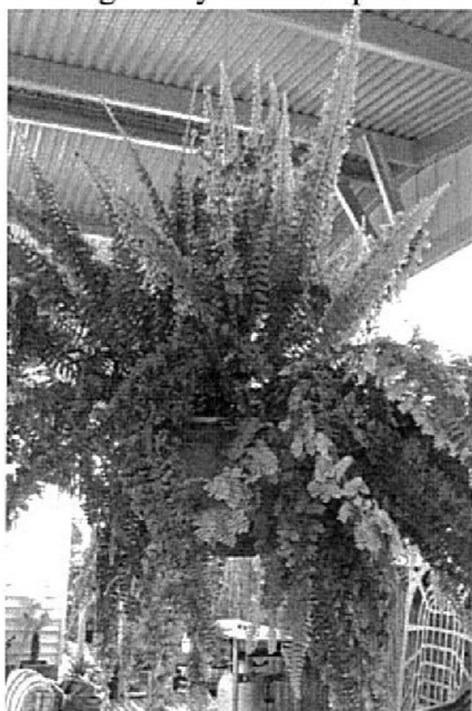
Nephrolepis cordifolia cv. plumosa from Kathryn Goodall's garden.

I missed not being able to look after the ferns for many years, but now are getting all the attention they need, hooray for that! We installed a 1,000 litre water feature with many gold fish, I sit out there often and enjoy listening to the gentle sound of the water and being mesmerised by the antics of the fish (yes they do have personalities), and the calmness of the environment, if the neighbours aren't mowing their lawns of course. In the background the turtledoves, top knot pigeons, fics, willy wagtails, rosellas, kookaburras sing away and pop in to see what there is for lunch that we have put out for them, and to have their daily bath. They give so much happiness to us both. It's these little things in life that matter, and a lot of people don't take the time to notice. It really is a shame. In a large Platycerium superbum we have a