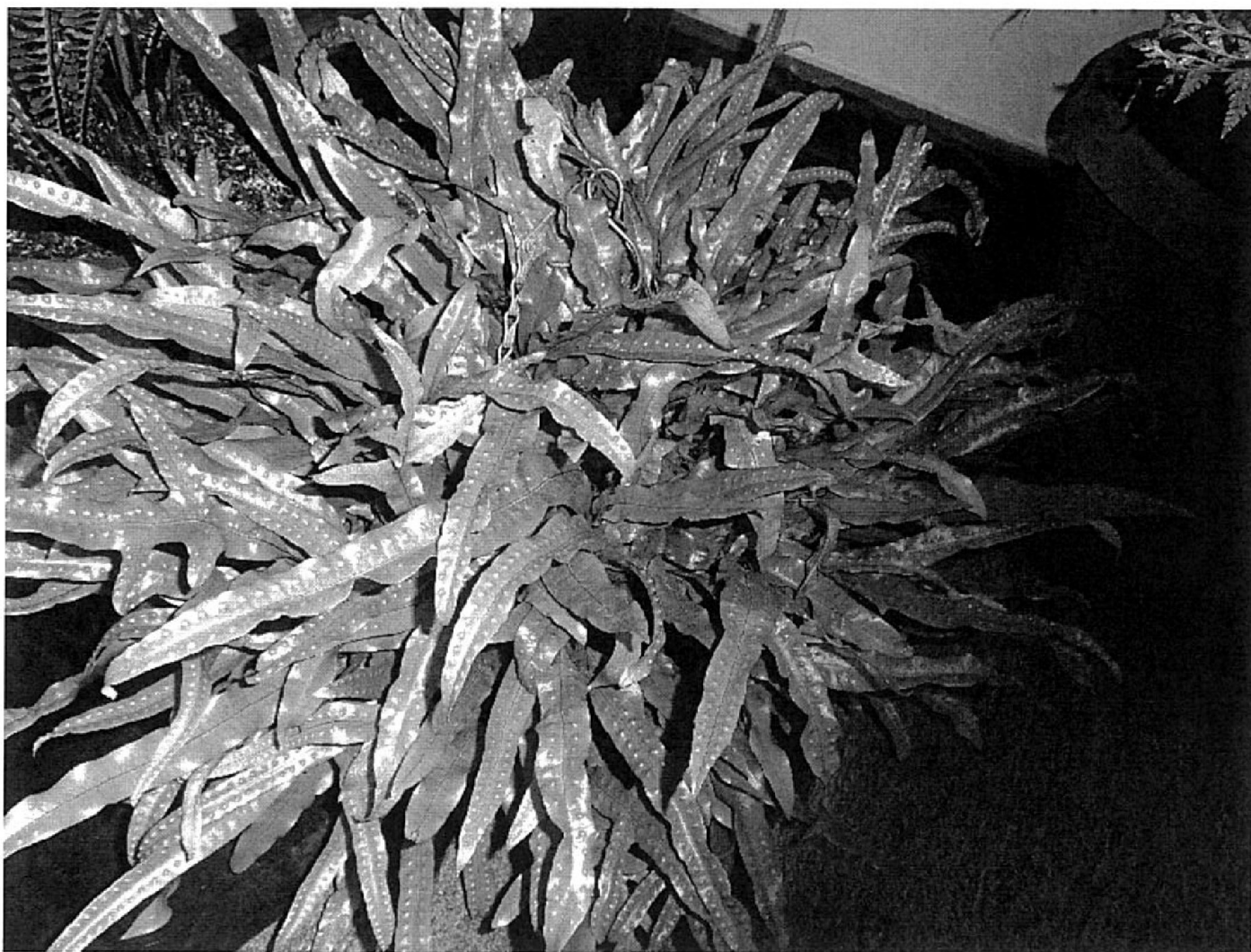
Above: Microsorium pustulatum, from Fern Society of Victoria meeting display and competition, November 2010.