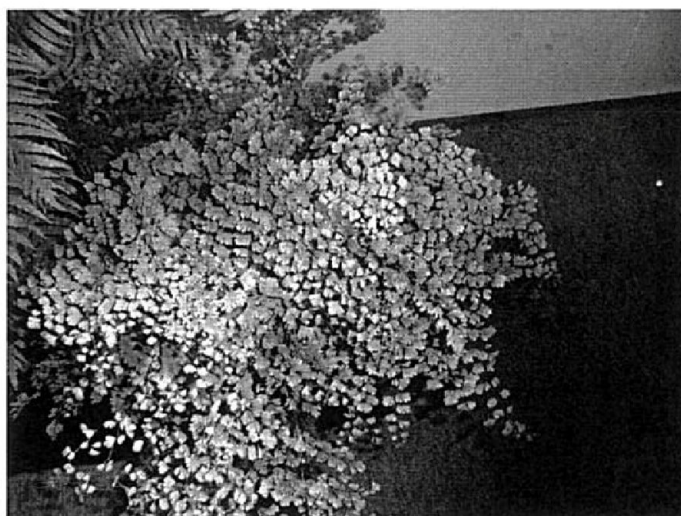
Above: Adiantum aethiopicum 'Frostii', from Fern Society of Victoria meeting display and competition, November 2010.