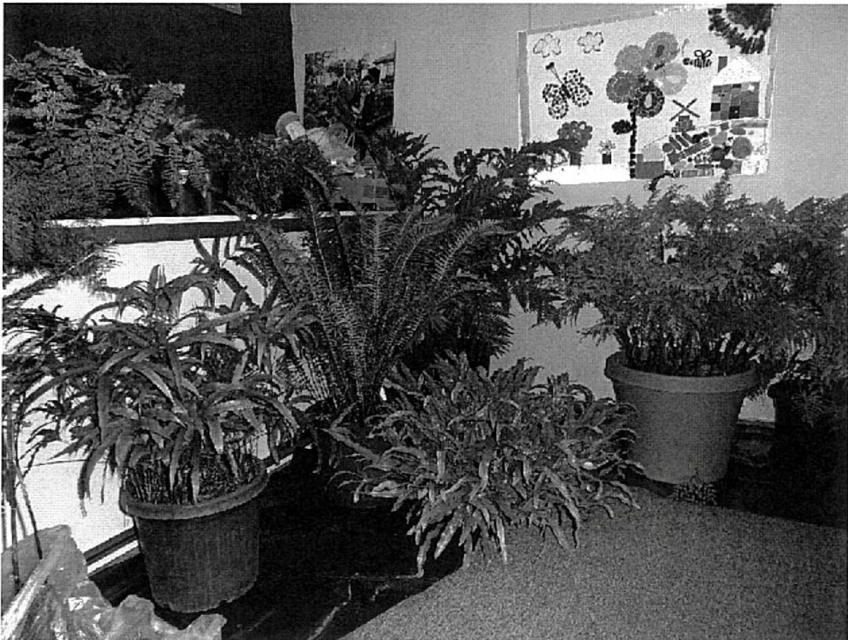
Victorian ferns, as exhibited by FSV members at the November 2010 meeting.